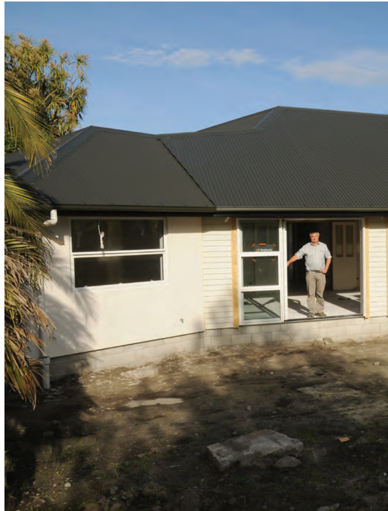
Nearly completed, thoroughly earthquake proof, new house.

I am, of course, also looking forward to all the mod cons of