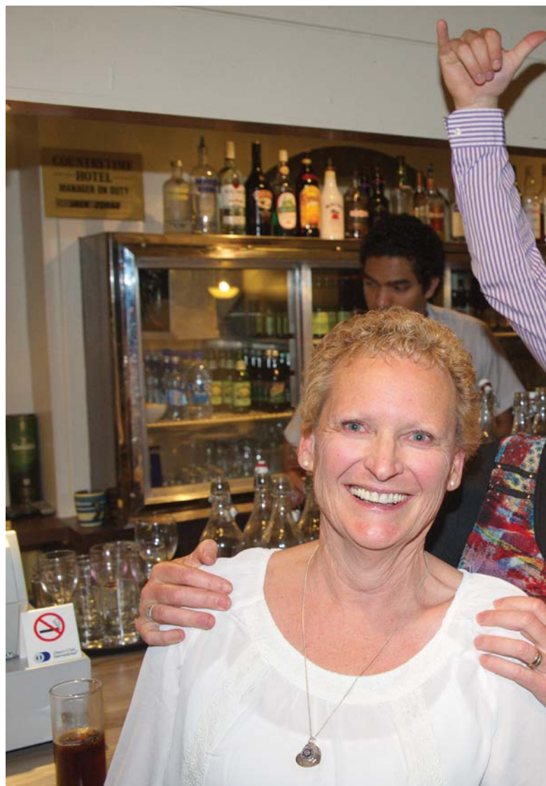
Letting off steam at the recent South Island Regionals