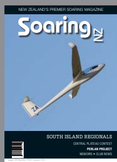
Charlie Tagg flying an LS8 at the South Island Regionals.

I urge you all to support these young people. This is a very expensive exercise and they're just starting out in the working